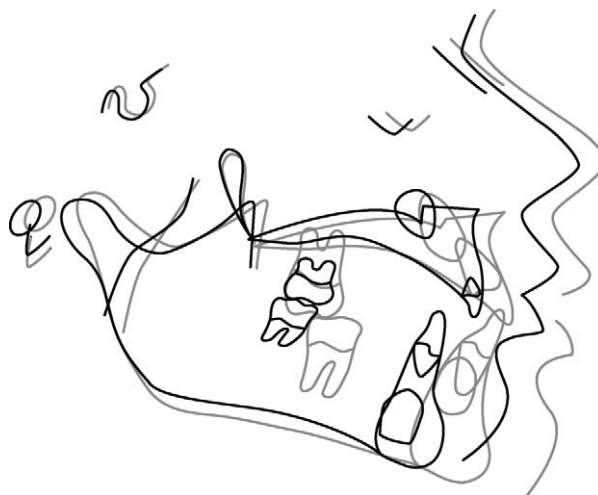
Figure 3. Treated child (JT) before (6.1 years) and after (8.9 years) treatment with eruption guidance. Superimposition on Frankfort horizontal at pterygoid verticale.

the eruption guidance appliance. 9 Complete age cohorts of children were screened in the deciduous dentition, and orthodontic intervention with the eruption guidance appliance was carried out in the mixed dentition in children showing a tendency to Class II occlusion, crowding, increased overjet or overbite with lack of tooth-to-tooth contact between the incisors, anterior crossbite, and/or buccal crossbite (scissors bite). A comparison with an untreated control group with similar malocclusions revealed that an efficient Class II