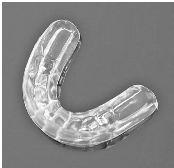
Figure 1. Prefabricated eruption guidance appliance (Occluso-Guide, Ortho-Tain Inc).